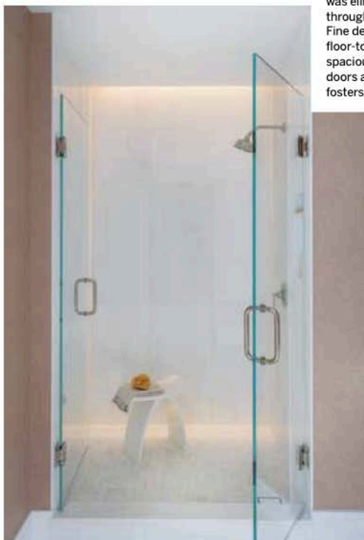
ABOVE: To make room for a king-size bed, a walk-in closet was eliminated in favor of a see-through unit from Molteni&C. Fine designed the upholstered floor-to-ceiling headboard. LEFT: A spacious shower features French doors and a recessed light that fosters a serene mood.

EDITOR’S NOTE: For details, see Resources.